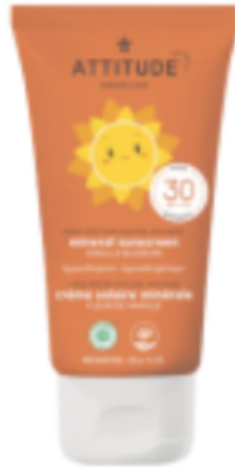
Plastic Free Mineral Sunscreen Stick - SPF 30 | ATTITUDE (attitudeliving.com)