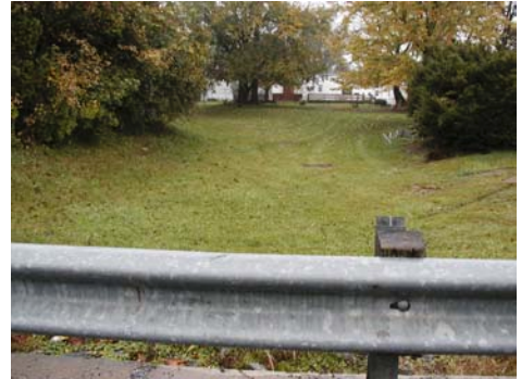
Example of the buried stream that could be uncovered

The panel also encourages the cities to revitalize the stream. Water sources have been proven as a regionalizing force and one of the most powerful elements of urban revitalization. By restoring the Evitts Run to a more natural state and uncovering portions of the buried stream through a stream exposure process called ‘daylighting,’ the stream and surrounding park space could become an attractive community asset.