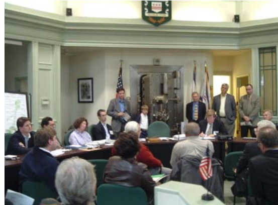
Panel members participate in the sponsor briefing

In order to manage the expectations of the community as to the timeframe in which the vision for the Commerce Corridor will become a reality, the panel made clear that the cities must understand that they will be dealing with market realities, and the vision will take time to successfully implement.