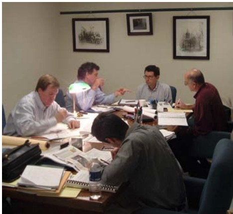
Panel members work to finalize their recommendations.

The theater will require public subsidy such as the city financing the building shell and parking for the theater. The cities should also engage a broker to find a boutique theater chain to outfit and operate the theater. If the City elected to construct the entire theater with public funds, it could approach one of the merchant theater operators such as Phoenix Theaters to operate the theater for it. If the City owned the theater, it could also use the space and building for other public / civic events which would help to justify the use of public funds for the initial construction. Modern stadium style theaters cost average $500,000 - $700,000 per screen. By focusing on the niche market, perhaps by creating a one-of-a kind experience such as a café theater, the panel believes that the theater will draw additional people to the downtown corridor.