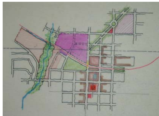
Rendering illustrating an alternative hospital location within the downtown area. Larger scale rendering is located in the Appendix.

The panel recognizes that there are good reasons not to devote the above sites to a hospital; two parcels are occupied by successful industrial enterprises, and the Ranson Civic Center which is to be located here would be lost to the hospital. These are tough choices for public officials to confront, and it may be determined that the loss of existing users is greater than the gains of the hospital.