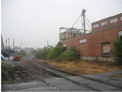
Area within downtown Charles Town that will be redeveloped as part of the Commerce Corridor.

To continue the successful implementation of this redevelopment project, a strong central body with joint accountability to both Charles Town and Ranson must be created. This body, which could take the form of a joint economic redevelopment authority, must have the power to purchase land, use eminent domain if necessary, demolish, and remediate contaminated properties. For the cities to rely on cajoling land owners to fully participate in the process is naïve. However, the cities should attempt to work with corridor property owners to assess their goals and capacity vis-à-vis the corridor vision, and only use eminent domain as a last resort.